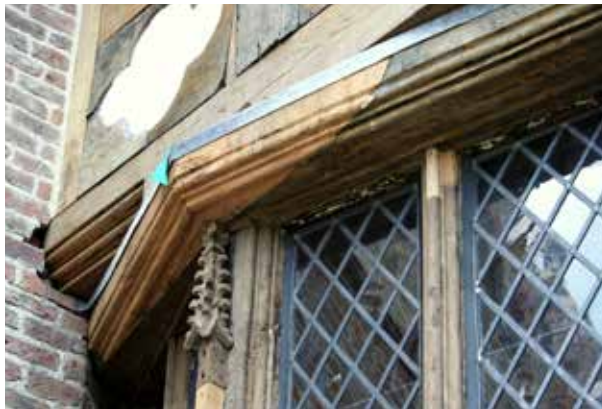
Conservative repair to a window head replaces as little fabric as possible.

THE SPAB APPROACH champions ‘conservative repair’ in opposition to ‘restoration’. Conservative repair can embrace a wide range of techniques. Its aim is to retain as much as possible of a building’s historic fabric. Sometimes it involves matching the existing materials of a building and sometimes use of compatible alternatives. Conservative repair is based on thorough investigation and understanding of the whole building and of the element directly concerned. It requires careful planning and appropriate craft skills. A good repair deals quietly and modestly with a problem, with a skilled repairer knowing when to hold back and when to intervene with the aim that work is done quietly, modestly and humbly but effectively.