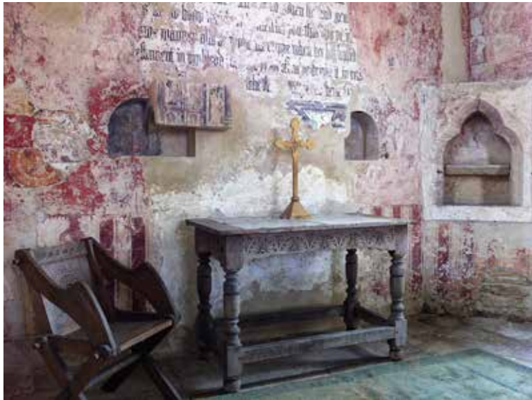
St John the Baptist Church, Inglesham, Wiltshire. William Morris paid for its conservative repair.

The SPAB's ideas stem from the thoughts of John Ruskin. In his 'Seven Lamps of Architecture' (published 1849) Ruskin railed against destructive work to old buildings, described at the time as 'restoration'. Ruskin called restoration 'a lie from beginning to end' because it sought to change the character of an old building by erasing the evidence and record of its true history. The SPAB's founders, led by writer and designer William Morris and architect Philip Webb, took up Ruskin's ideas and translated them into the Society's founding Manifesto . The Manifesto remains a concise and beautifully poetic expression of SPAB conservation principles, as relevant to the needs of today as to those of the 19th century. SPAB members have applied the Manifesto's ideas to the care and repair of thousands of historic structures in the UK and beyond.