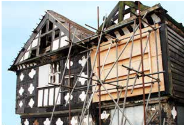
Emergency work to fire-damaged Tonge Hall, Tonge, Middleton, Greater Manchester.

THE SPAB APPROACH involves taking a long term view of a building's care and needs. The Society has seen many examples where repair for re-use has been considered unviable at a certain point in time – usually by virtue of cost or surroundings – only to become a more attractive proposition at some later date. Many country houses or old cottages, for example, were viewed as 'white elephants' in the mid 20th century, but where they have survived are now considered valuable and useful property. Sometimes full repair is not possible at a particular point. In such cases, temporary repair can buy time for a building, halting decay or reducing its rate.