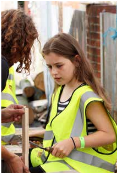
Sharing traditional skills with school children at a SPAB Working Party.

The Society's founders were concerned not only with conservation theory, but also its practice. This interest in the practical has been developed through the work of the Society's members over many generations. Passing on and developing knowledge is a vital part of THE SPAB APPROACH . The Society seeks to help those entering the conservation field, and all those who wish to develop their existing skills and experience of old building care and management.