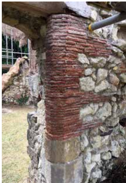
Tile repair: a method sometimes used by SPAB members to follow the eroded contours of a building and minimise fabric replacement.

The Society does not generally encourage re-use of materials on a building when they have been taken from another structure. This is because the inclusion of historic materials from else-where can confuse an old building's history. Furthermore, salvaged materials are a finite resource, and damage or loss of interest sometimes results when they are taken from one building for use on another. Production of traditional building materials helps ensure a continuing supply for future repair work.