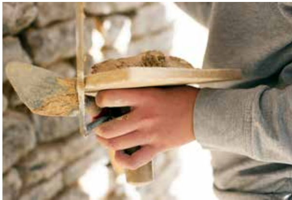
The SPAB has led the revival in use of traditional lime and earth-based mortars, plaster and renders.

Conservation work often requires creative thinking and ingenious planning. Despite this, the techniques to be used should be tried and tested. New techniques of repair may become useful once proven, but old buildings are not the place where experimentation should occur. There are many instances where new repair methods and products, considered a panacea in their day, have proven ill-advised and harmful over time. Much effort is expended in undoing well-intentioned but misguided works of the past.