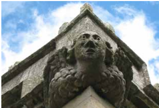
Weathered carving, All Saints Church, Theddlethorpe.

The ‘oldness’ of a historic building is a precious quality. It is the patina of age that distinguishes old from new. Those signs of age, often held in the slender surface layers of an old building, deserve special consideration. They may be the undulations of old plaster, the dip in a roof ridge, or the wear on stair treads. Sometimes wear and tear becomes a practical problem, but, wherever possible, THE SPAB APPROACH encourages restraint. Through respect for the signs of age in surfaces and architectural features, the integrity of the whole as an old building will be retained. Thoughtful management and maintenance help slow down the more harmful effects of decay.