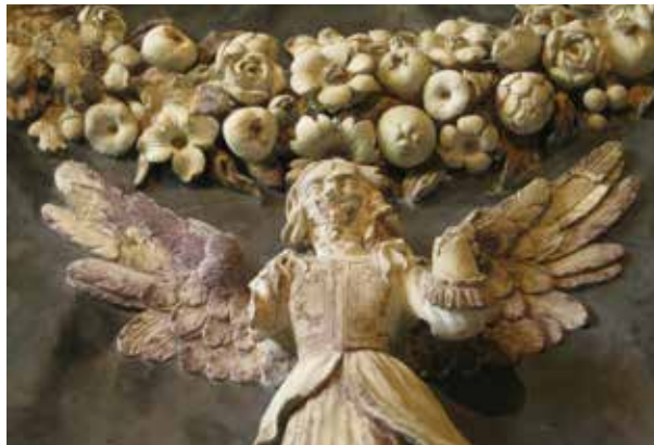
Monument at St George's Church, Hinton St George, Somerset conserved without restoration of lost detail.

Restoration of the kind opposed by Ruskin and Morris sets out to turn back the clock or to recreate the past. Its often a destructive process and may leave a building without the signs of age or evidence of its past interaction with people. Knowledge of an original design is not sufficient reason for erasing later change, particularly where this change has added positively to a building's historic interest. Also, the Society believes that damaged or missing elements of a building do not necessarily need to be replaced, except where there is a functional need. Then, small-scale, localised reinstatement may be justified, but only if carried out for well-considered, practical reasons. Reinstatement for the sake of tidiness, or to recreate historic design or detail is at odds with THE SPAB APPROACH .