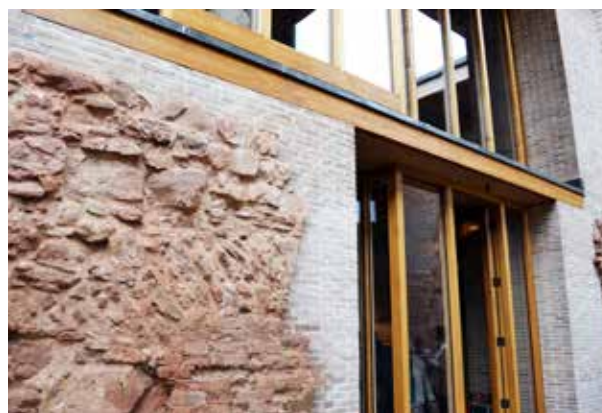
New complements the old at Astley Castle, Warwickshire.

The Society recognises that, from time to time, old buildings may need sympathetic alteration, adaptation or extension to ensure their continuing usefulness. There are occasions, the SPAB Manifesto argues, when it may be better to leave an old building unaltered and to build a new one if the adaptation required would involve serious damage. These cases are the exception. Generally, modest, sympathetic new works allow continuing life for old buildings and can contribute positively to their interest and story. Further alterations and additions, the Society believes, are best when they complement what exists. They should not compete unduly with the old building in form or position; nor should they mimic the original or pretend to be historic. They should fulfil modern needs in a way that respects both the old building's form and context. The new should not harm the old where they meet, nor create problems with future maintenance.