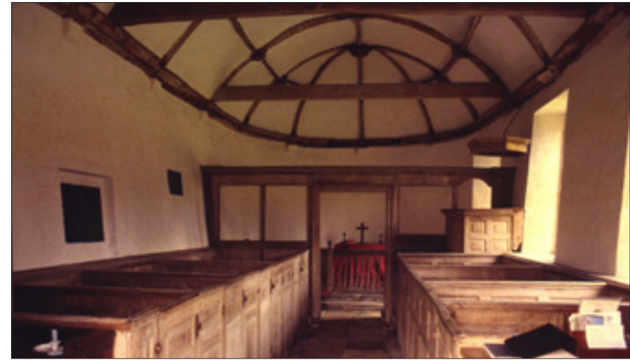
Repairs to Winterborne Tomson Church, Dorset, received a grant offer from the SPAB's Thomas Hardy Memorial Fund.

The SPAB continues to grow in strength as a powerful voice for historic buildings and an effective link with people and communities. We remain unequalled in the role we play in educating and training present and future generations in the proper care of our unique architectural inheritance. This Annual Review shows just some of the many ways the SPAB is working to prevent needless damage and destruction.