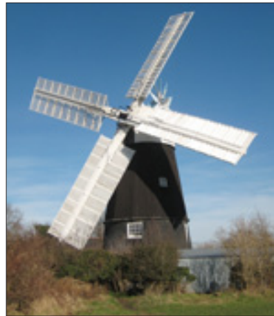
Wicken Mill, Cambs, received a grant from the Mills Repair Fund.

An example of our exploring new avenues including partnering with like minded organisations was "From Crop to Crust", the Section's April Meeting and Conference held in partnership with the Traditional Cornmillers Guild and Real Bread Campaign. Hosted by the NFU Mutual, the conference brought together some 100 farmers, millers, bakers and associated enthusiasts to explore the role of the traditional mill in the food chain that binds these three groups together. As well as learning more about each other's respective business areas and the renaissance of interest in artisan flour and breads, the conference provided an important networking opportunity helping to further safeguard the future of working mills in the UK.