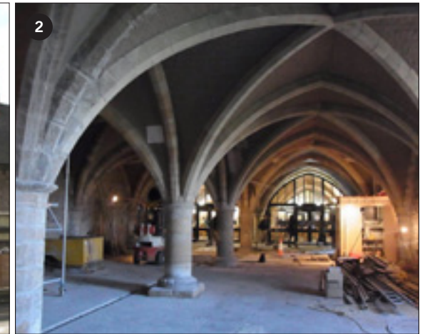
1 The Robin Hood Hotel, Newark: the SPAB successfully opposed an application for total demolition. 2 The Society committed significant time and effort to the discussion of proposals for Durham Cathedral.

of work, including casework, contribute directly to the NHPP's aims and are cited in the Plan.